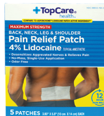
Lidocaine Patch, 4% Count: 5 ct.