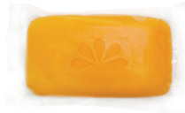
Anti-Bacterial Bar Soap Count: 1 ct.