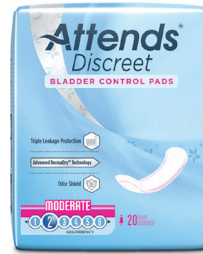
Attends® Discreet Women's Moderate Bladder Control Pad* Count: 20 ct.