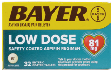
Bayer® Enteric Coated Aspirin, Low Dose, 81 mg. Count: 32 ct.