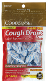
Cough Drops, Sugar-Free Count: 25 ct.