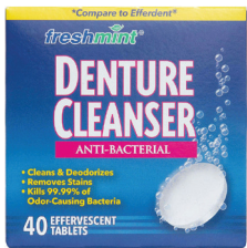
Denture Cleaning Tablets Count: 40 ct.