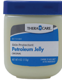
Petroleum Jelly, 4 oz. Count: 1 ct.