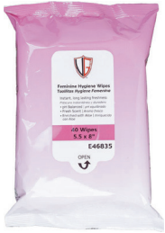
Feminine Hygiene Wipes Count: 40 ct.