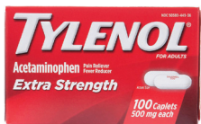
Tylenol® Extra Strength Tablets, 500 mg. Count: 100 ct.