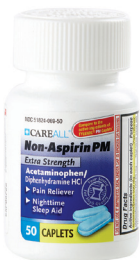
Acetaminophen PM Extra Strength Caplets, 500 mg., 25 mg. Count: 50 ct.