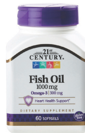
Fish Oil Softgels, 1,000 mg.‡ Count: 60 ct.