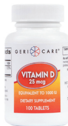
Vitamin D3, 25 mcg.† Count: 100 ct.