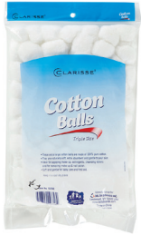
Cotton Balls Count: 100 ct.