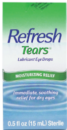
Lubricating Eye Drops, Refresh Tears®, 15 ml. Count: 1 ct.