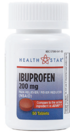
Ibuprofen Tablets, 200 mg. Count: 50 ct.