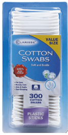
Cotton Swabs Count: 300 ct.