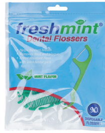
Interdental Flossers Count: 90 ct.