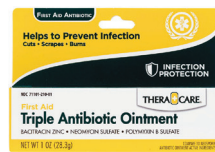
Triple Antibiotic Ointment, 1 oz. Count: 1 ct.