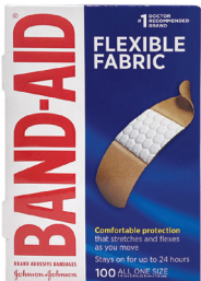
Band-Aids®* Count: 100 ct.